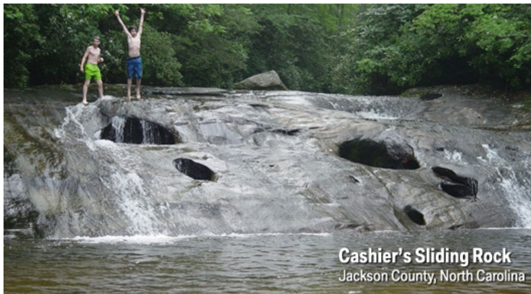
Cashier's Sliding Rock Jackson County, North Carolina