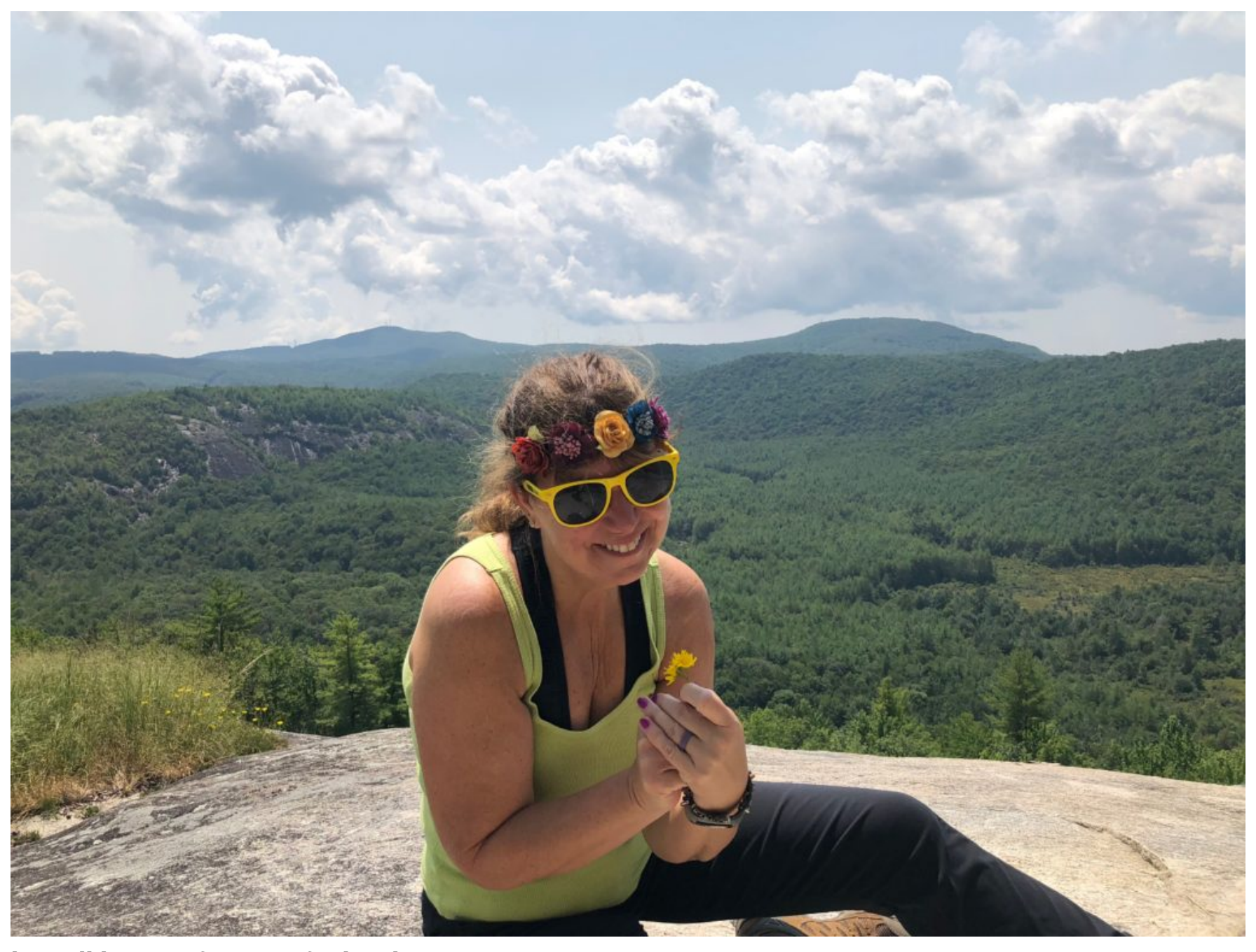
This will be a perfect spot for lunch!

Next, we'll make our way down to the Carlton's Way trail, the trail is eroded in spots, and descends through a few switchbacks before arriving at its bottom junction with the North Road trail, turn right.