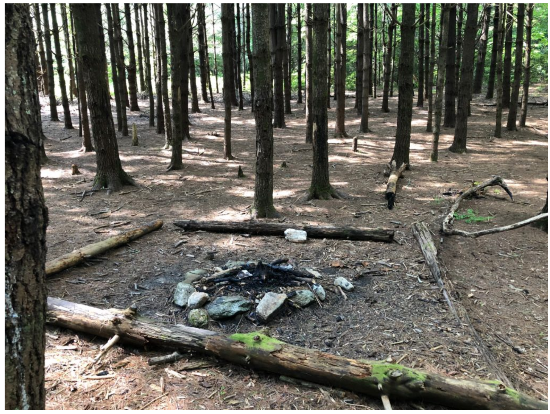
Shortly thereafter, you'll find a nice new bridge, hang a right on Panthertown Valley trail before going left on the Mac's Gap trail, which winds through a White Pine forest with camp sites and fire pits ready to use! It crosses the creek on a rickety old bridge, just past the bridge, hang a right on the Granny Burrell Falls trail

Next, we'll make our way down to the Carlton's Way trail, the trail is eroded in spots, and descends through a few switchbacks before arriving at its bottom junction with the North Road trail, turn right.