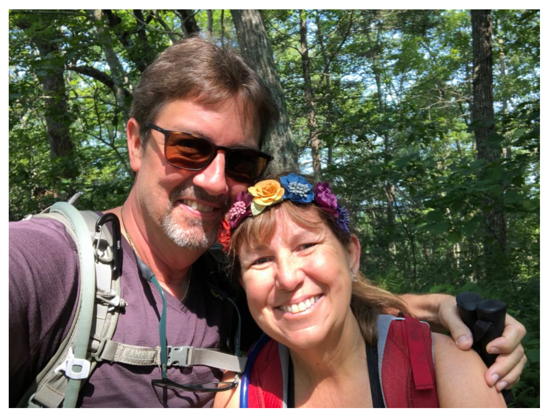
My Flower Girl