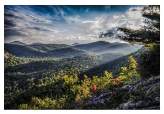
Our hike will start at the Salt Rock Gap parking area (bulletin board) at the end of Breedlove Road in Cashiers.