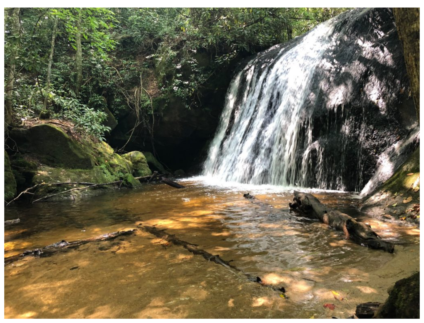
Climb up past the falls, to the Great Wall trail, and hang a right. The trail crosses the creek on stepping stones.

Check out the Wilderness Falls trail if time permits on the way back. Or, climb up past Salt Rock and back to the parking area.