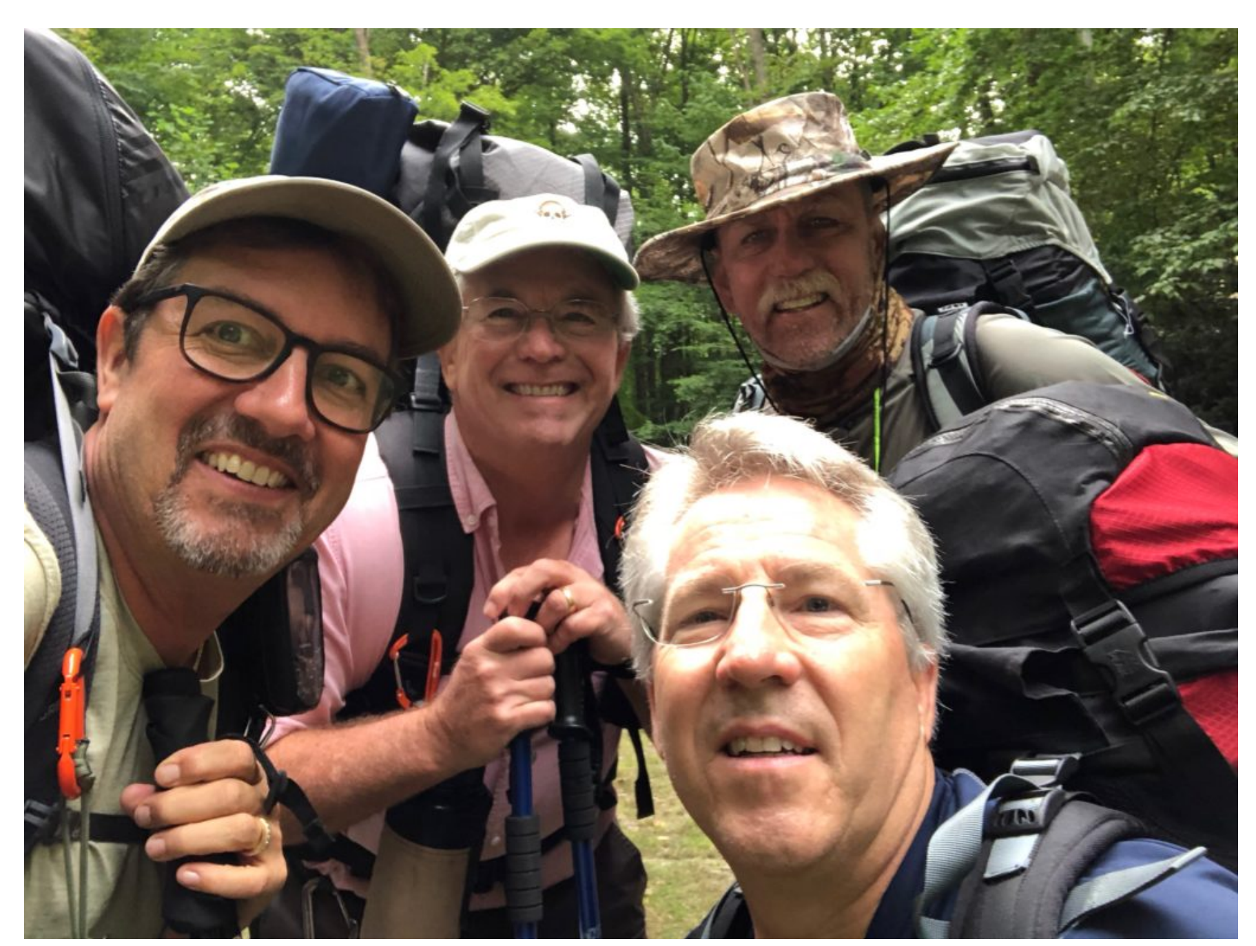
Due to the elevation, it was very cool and crisp! Here we go, all refreshed and ready to hike!

We arrived at 8.30 AM parked and took the Hyatt Ridge Trail starting with a steep climb, gaining 1,500 feet in less than two miles.