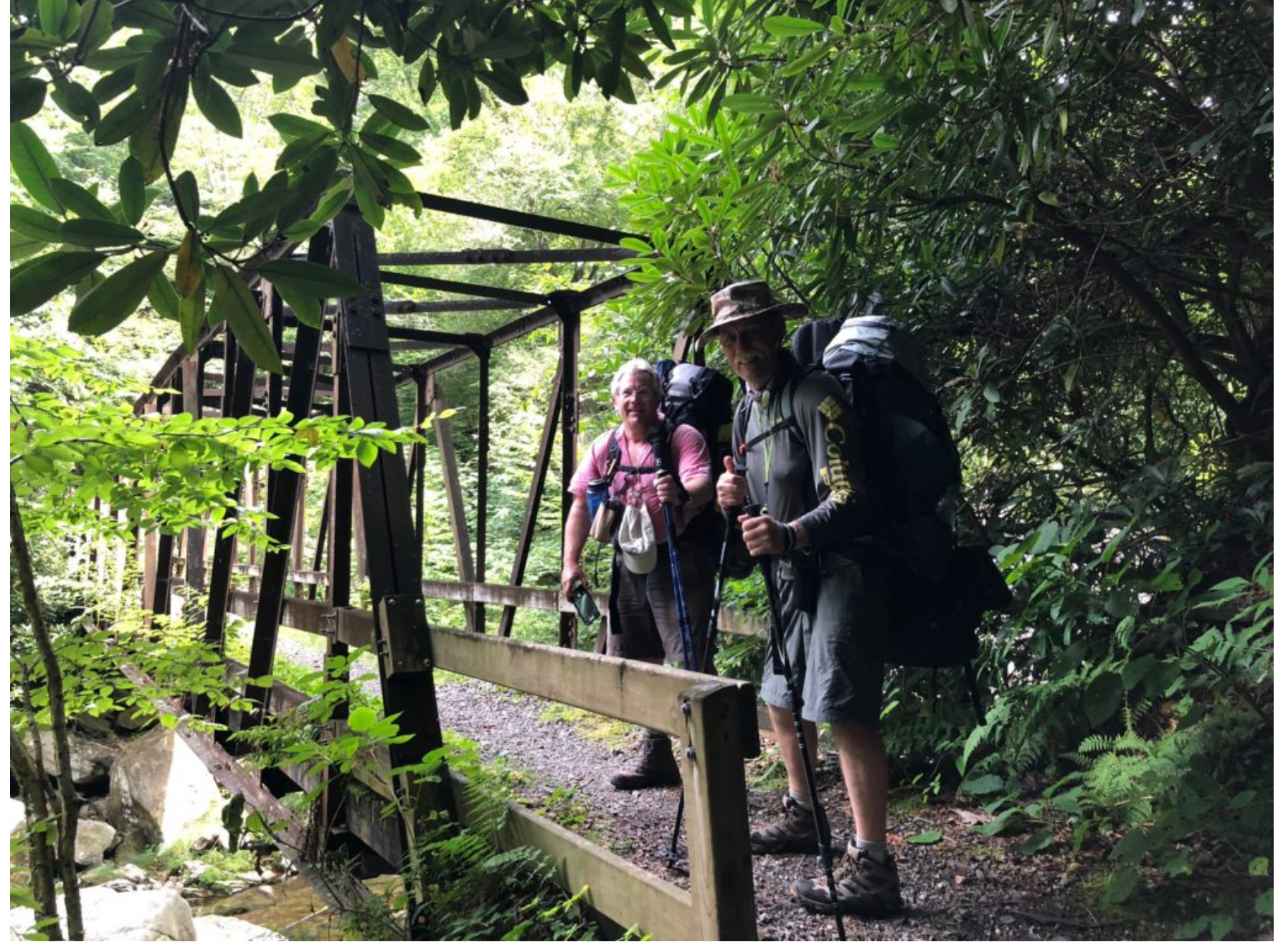
We spent the next few days fishing and hiking and eating. We had a blast. Take a look at some of the highlights.