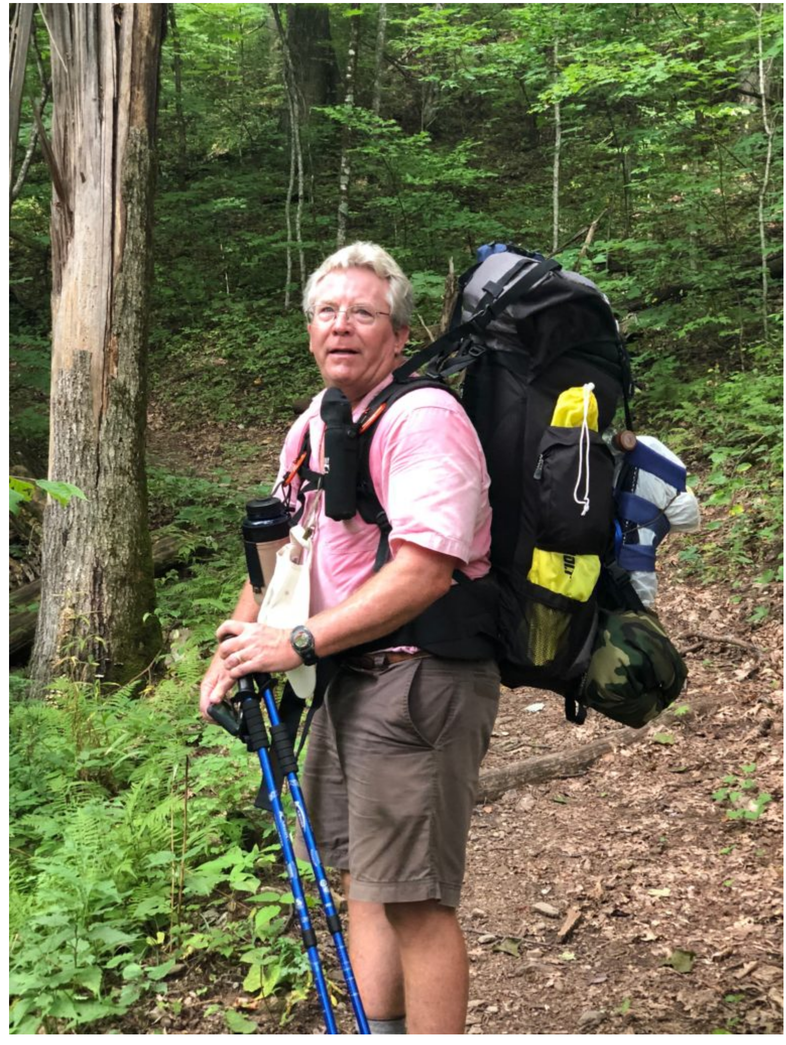
It doesn't look that steep from the pictures, but, trust me – it is!