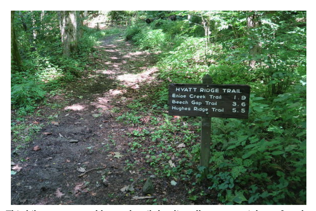
This hike was on an old gravel trail that literally went straight up for what we measured 2.4 miles.