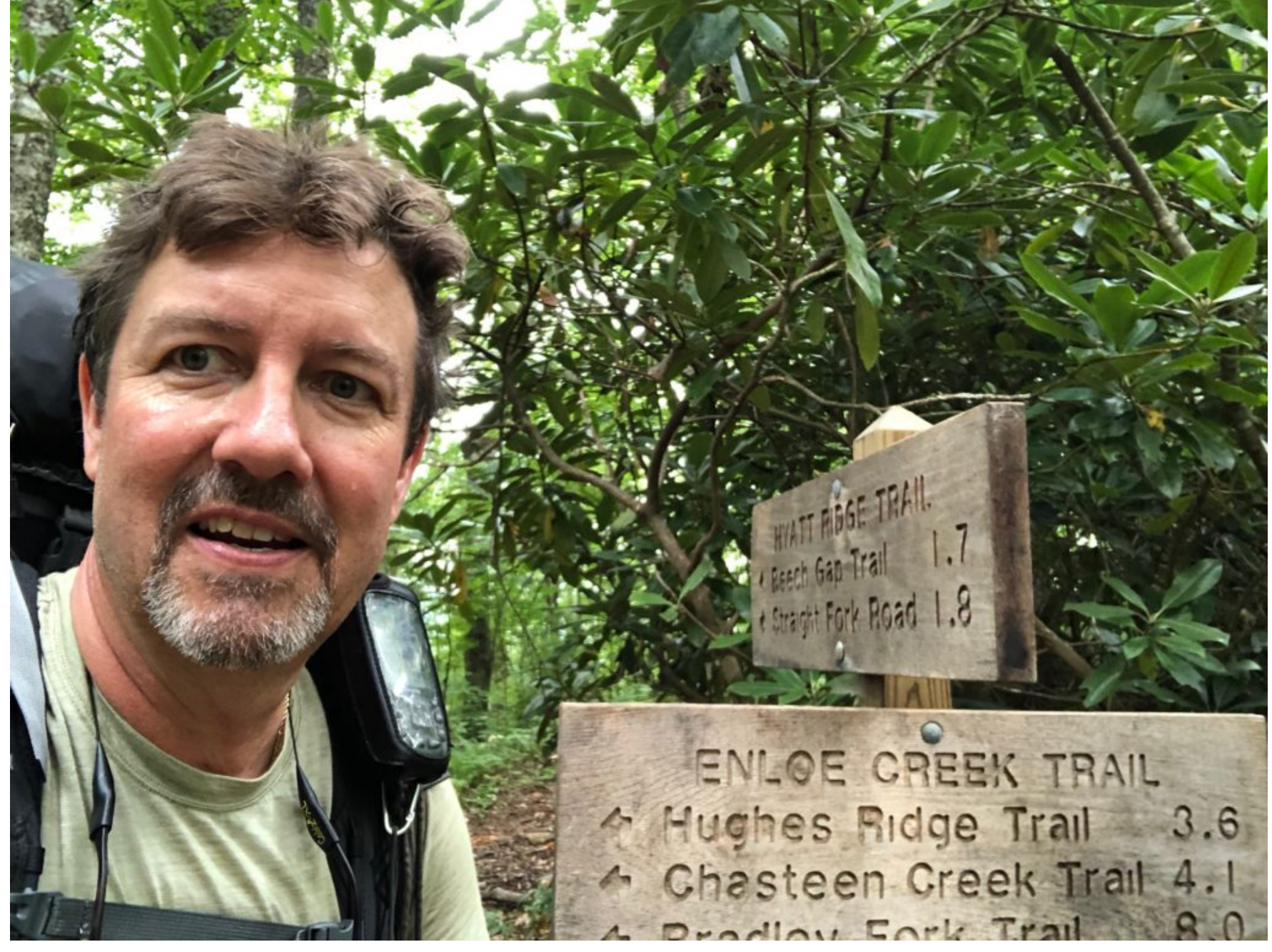
We made it to the ridge and thought we were home free, well, the downhill hike was almost as tough as the uphill portion we'd just done!