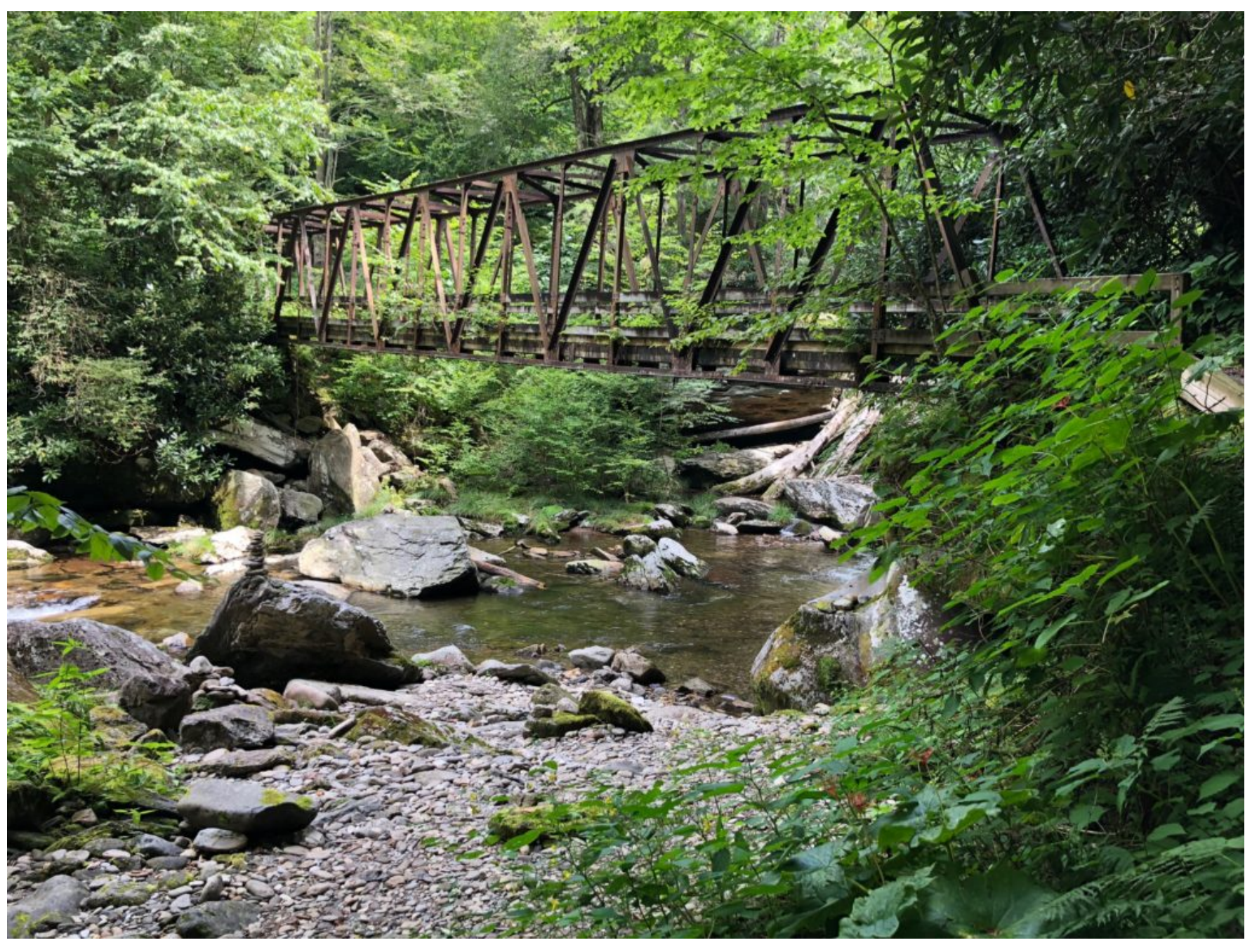
We see the bridge and cant wait to setup camp!