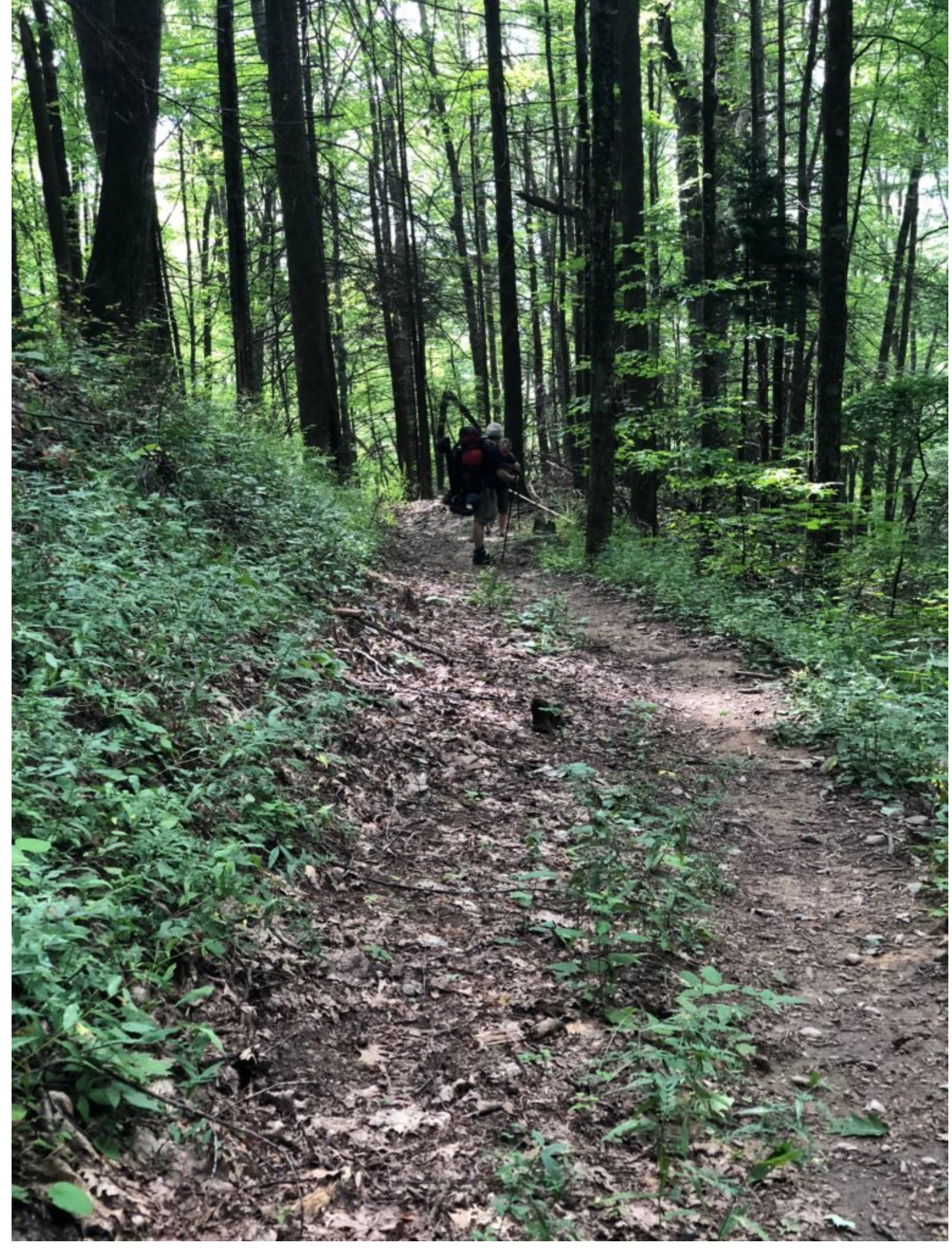
At the ridge go straight ahead and down via the Enloe Creek Trail to site 47 after a right turn over the bridge.