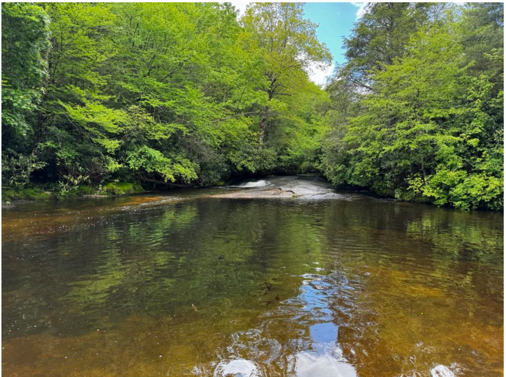
On the final stretch back to our cars, we saw some wild flame, Azalea and all its bright, orange glory.