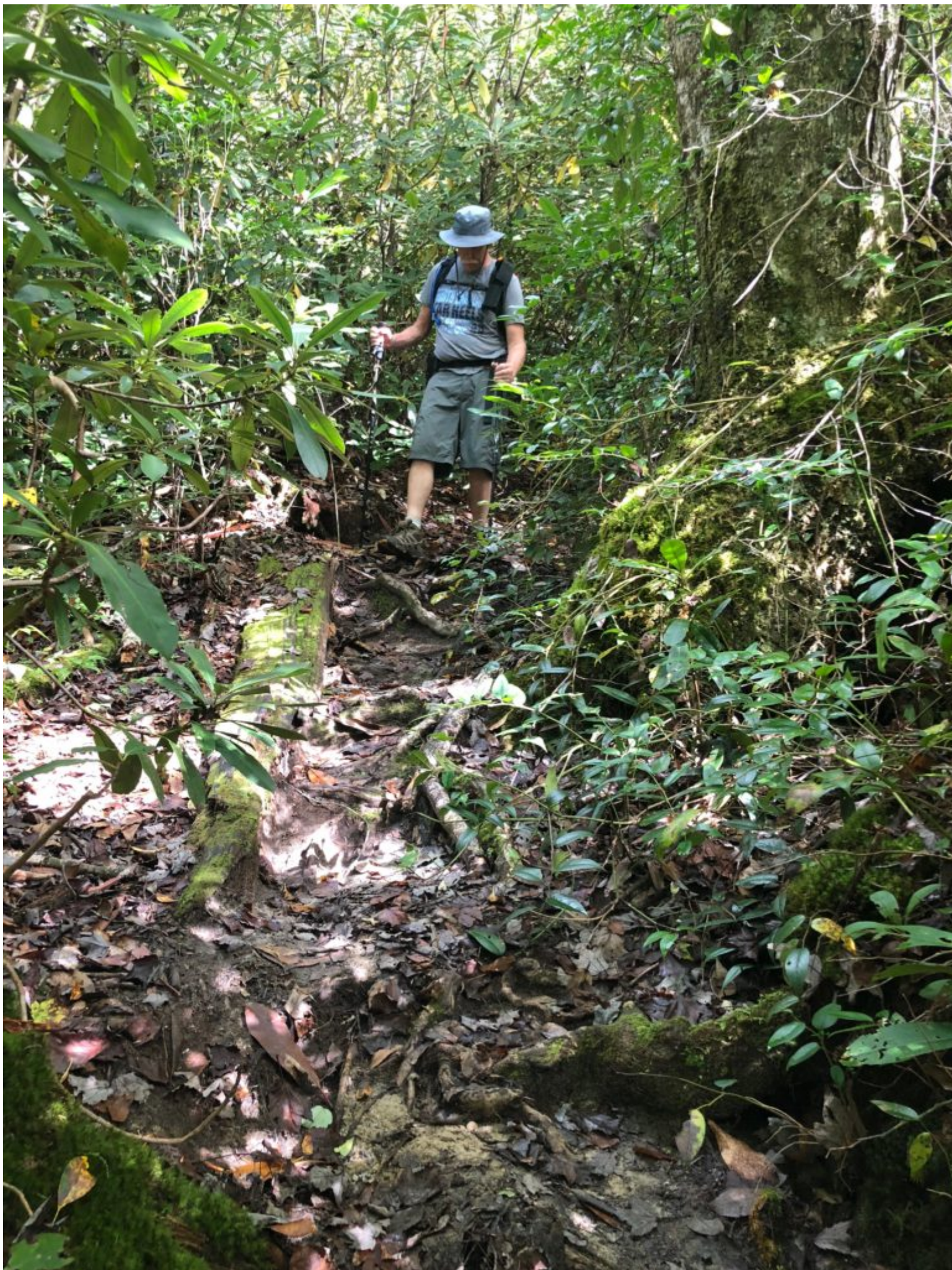
The next waterfall, Par Falls coming right up number 7. This one is really nice also and has much different character than the last.