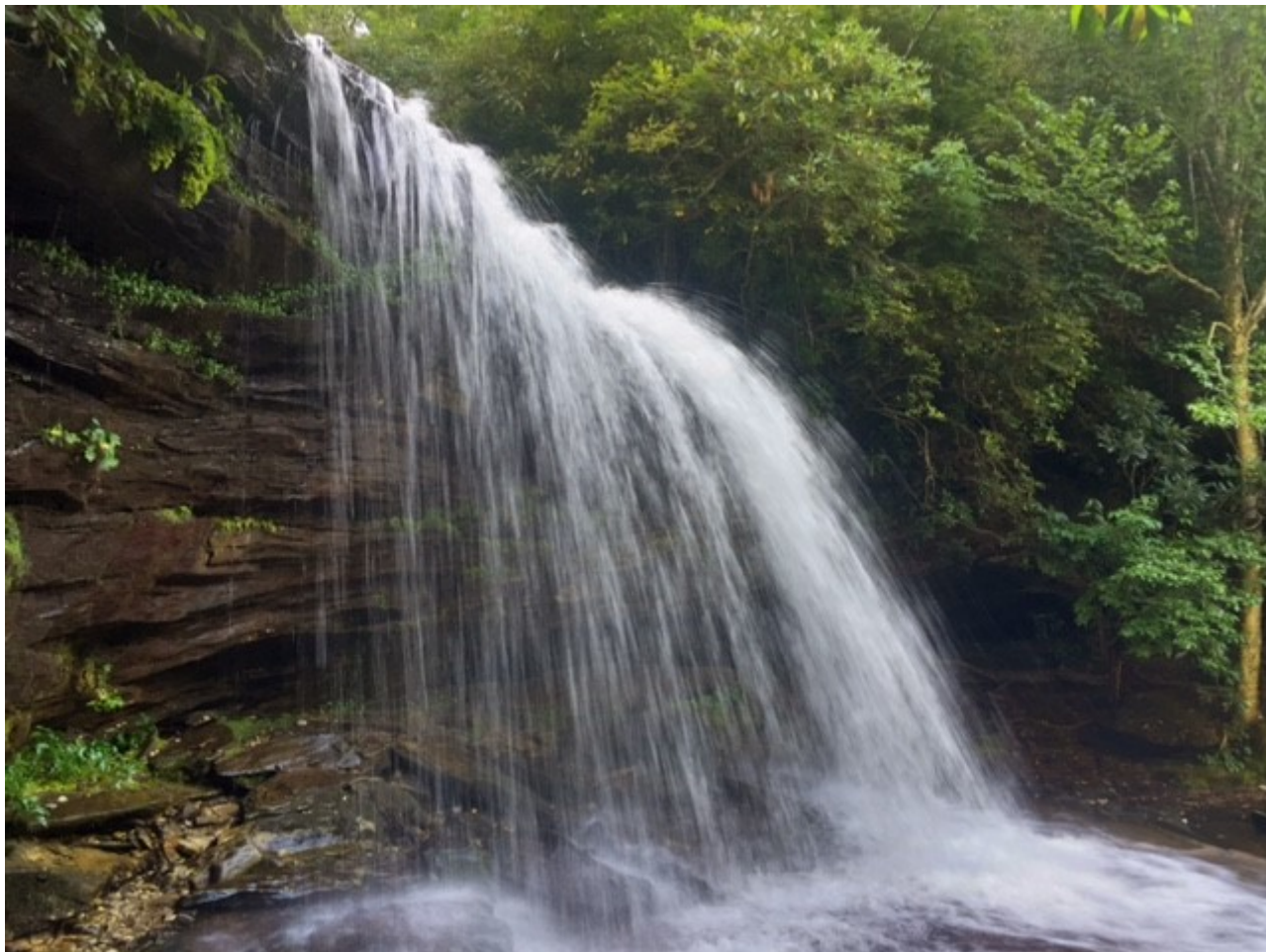
Awesome Side View