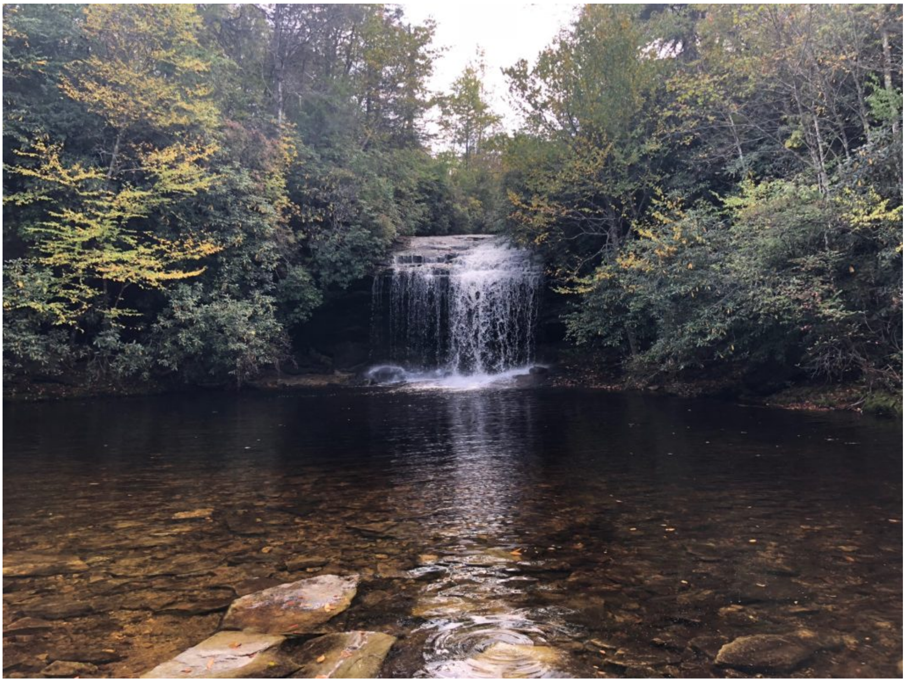
Swimming Pool in Front