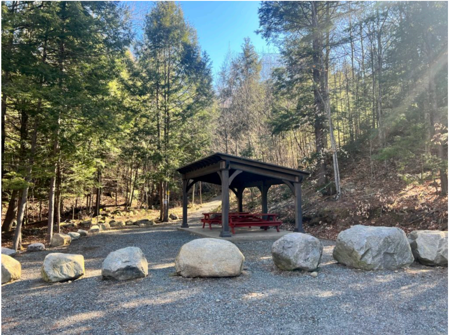
Potash Mountain Trailhead Shelter

Robbie and I decided to hike this 3.5 mile hike to Potash Mountain. It turns out to be an open summit that seemed more like a meadow than the top of a mountain with several vantage points and different views. We spent some time “taking it in” at the top. At the start we both noticed a nice shelter with a stamped concrete floor and a large picnic table - a great place to get organized and plan for our ascent to the peak at 1750 feet in elevation! We started out at 9:45 am sharp and the temperature was a brisk 39 degrees. With the sunny weather prediction, we knew, we’d be peeling layers.