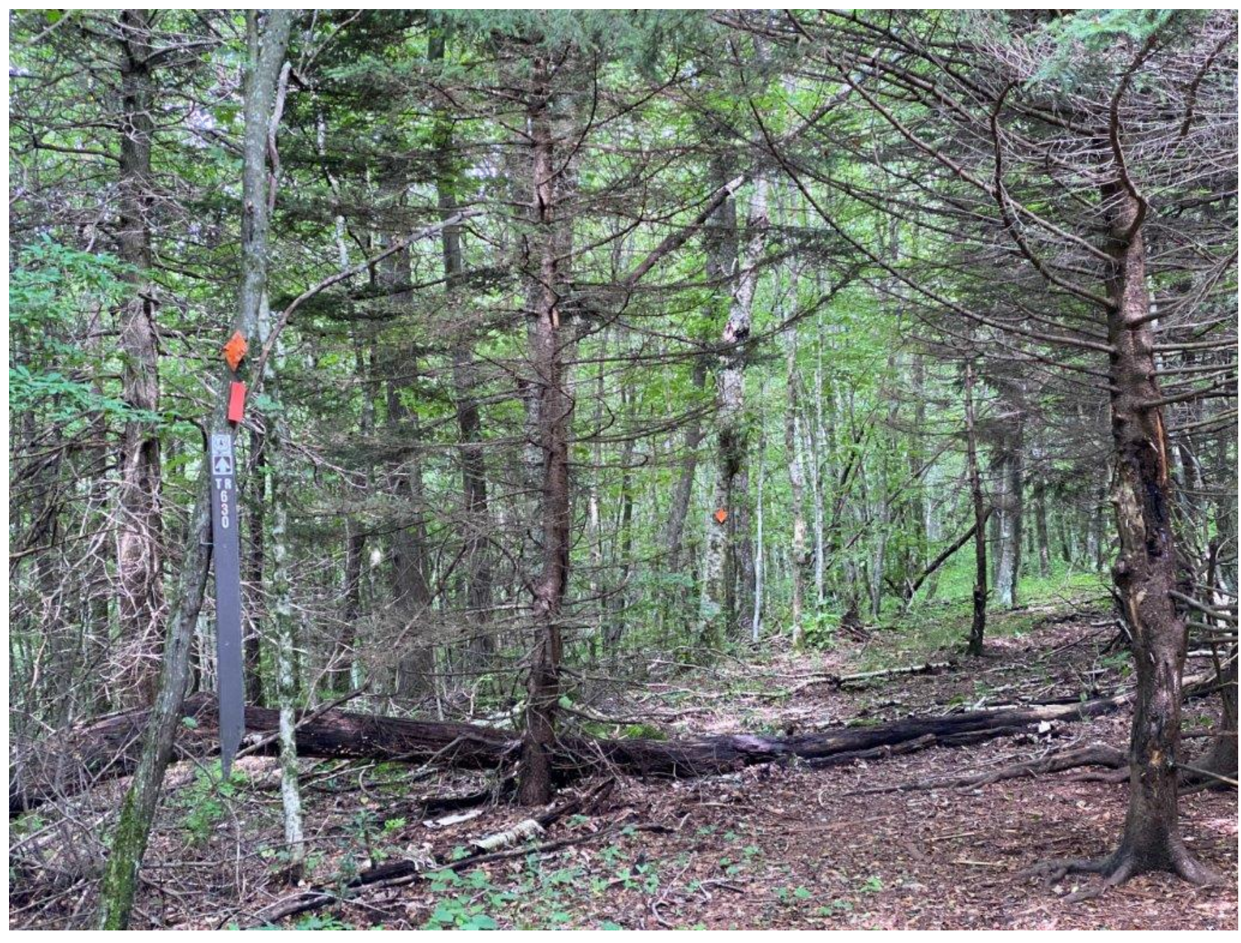
Be very careful and as you come into this junction turn right on 631. Look behind you and notice the trail you came in on and that you are actually going right. Follow 631 to your next right on the white blazed AT.