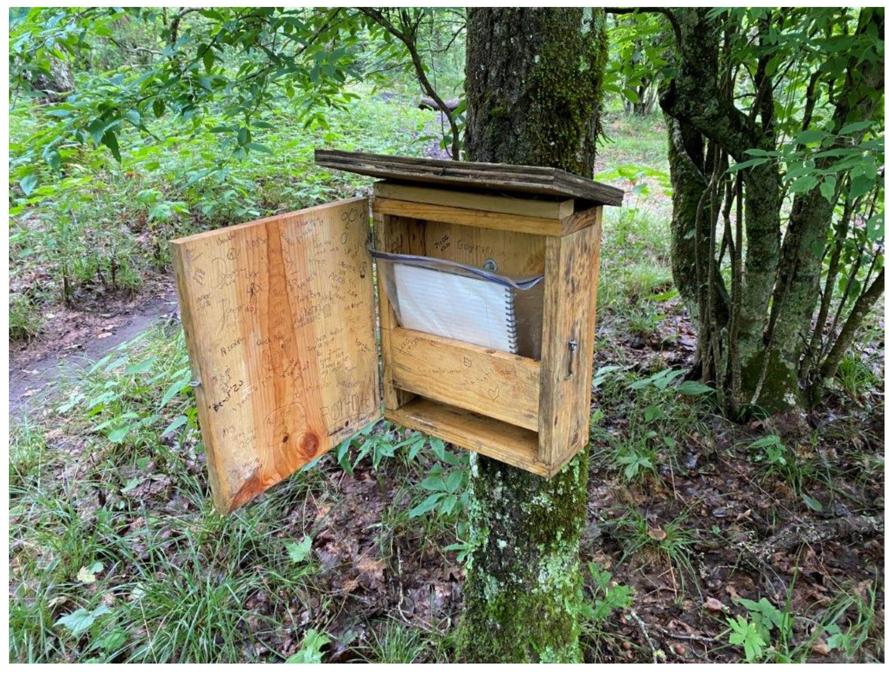
You'll see a sign for Water - spring on your right lose by to refill your drinking water!