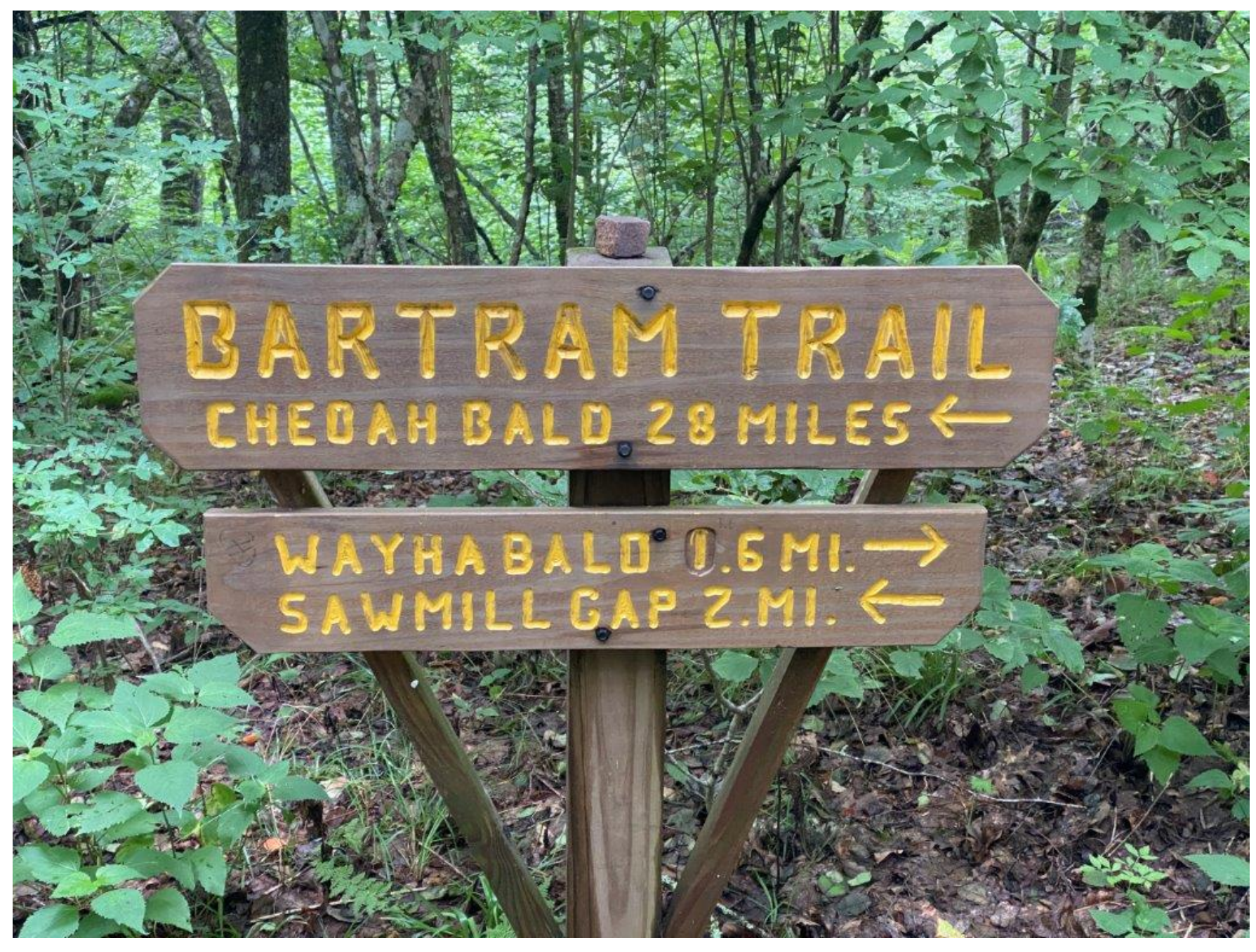
The rest of the way down to sawmill gap enjoy the views. It's easy from here out as it's mostly downhill!